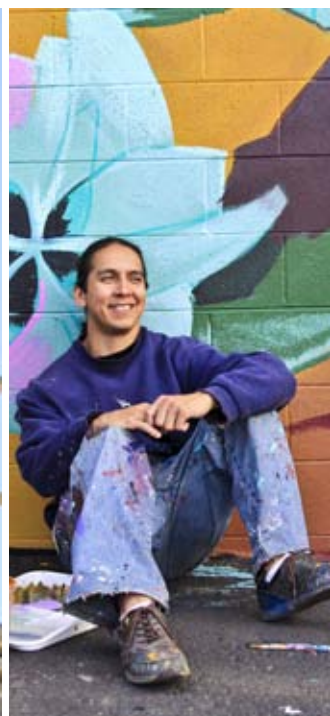
Steven Lopez (USA), 2016