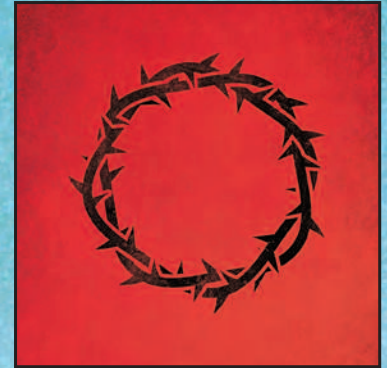
[re]Discovery Series Bach: St. John Passion July 5, 10, 12