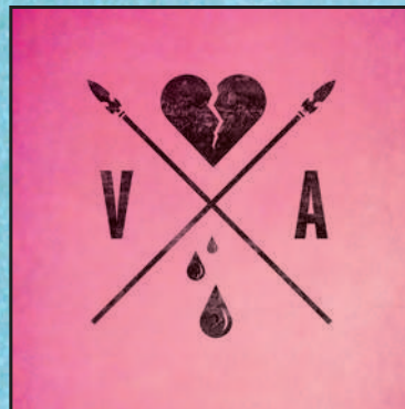
Venus & Adonis July 7