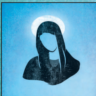
The Protecting Veil & Howells Requiem July 9