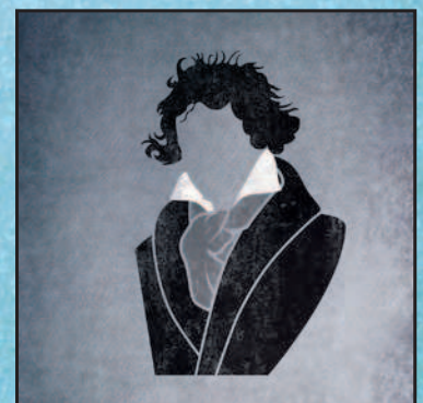
Beethoven: Missa Solemnis July 15