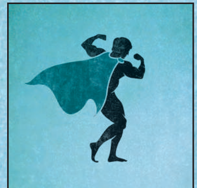
Handel: Hercules July 8