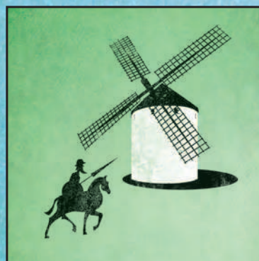
Don Quixote July 13