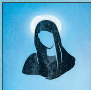
The Protecting Veil July 9