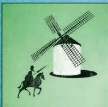
Don Quixote July 13