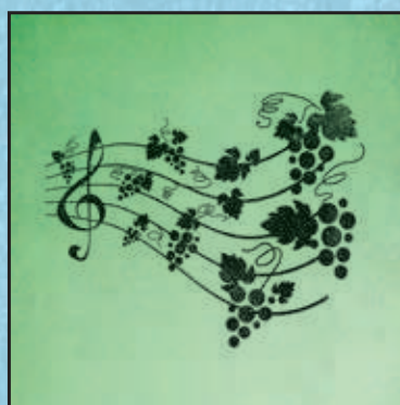
Serenade Wine Excursion July 10