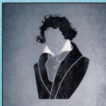
Beethoven: Missa Solemnis July 15