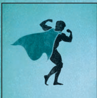
Hercules July 8