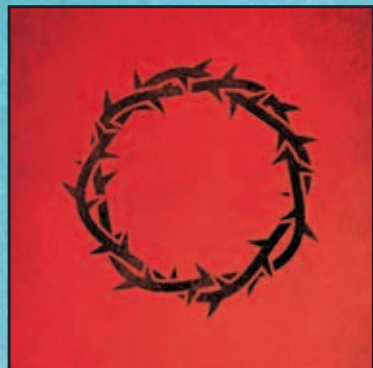
[re]Discovery: St. John Passion July 5, 10, 12