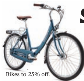
Bikes to 25% off.