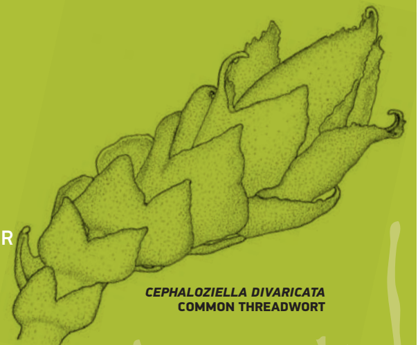
CEPHALOZIELLA DIVARICATA COMMON THREADWORT

For the past six months or so, some animal has been digging holes next to the path along the ponds on the east side of Delta Highway. Tracks left in mud on the path after a winter rain finally gave us a clue: nutria. Their distinctive tracks include a tail streak between footprints. Nutria are well known to dig up roots, worms and bugs. They seem to have been eating lots of roots of poison hemlock since its leaves have appeared. Considering how deadly it is to humans, I wondered how nutria could survive. Then I met the volunteers who work with the city habit restoration program and found they have been rooting out poison hemlock for the past month. Nutria are off the hook.