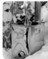
Survivor Rocket Stove