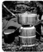
Ultimate Scout Kit