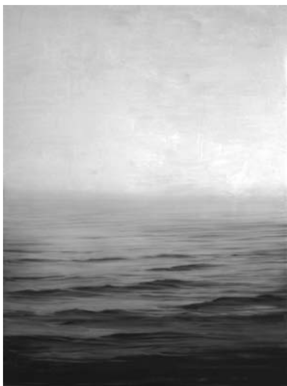
'BIG WATER' BY BRIAN SOSTROM AT MAUDE KERNS

Jazz Station "Night Vision," photography by Tricia Clark-