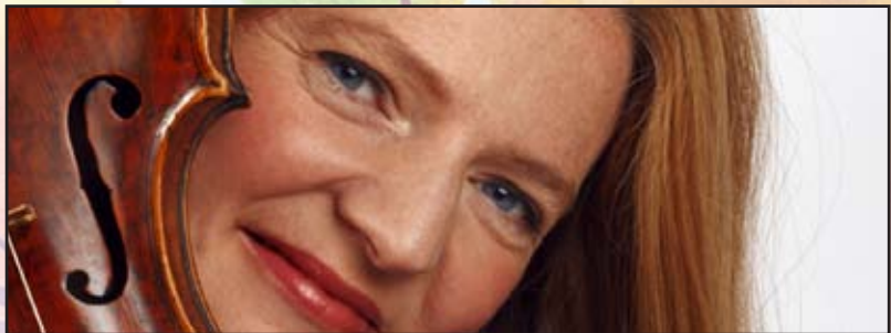
RACHEL PODGER PERFORMS SONATAS AND PARTITAS JULY 9 • 7:30PM