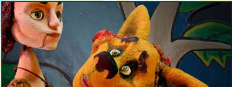
TEARS OF JOY PUPPET THEATRE PRESENTS JUNGLE BOOK JULY 9 • 10:30AM