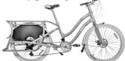
Large selection family, cargo & electric assist bikes.

Facebook.com/arriving.by.bike, www.abb.bike 2705 Willamette St • 541.484.5410 Mon.-Fri. 11-7, Sat. 10-6, Sun. 12-5