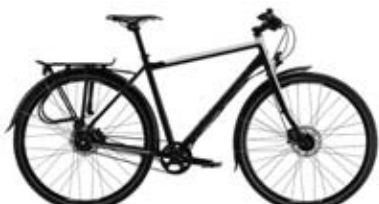
Town, road touring, & adventure models.

Super bike deals & rebates. 50% off bike accessory packages!