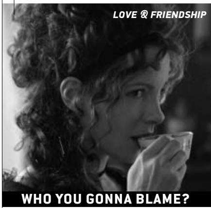
LOVE & FRIENDSHIP