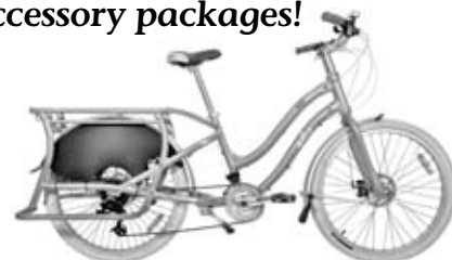
Large selection family and cargo bikes

Facebook.com/arriving.by.bike , www.abb.bike