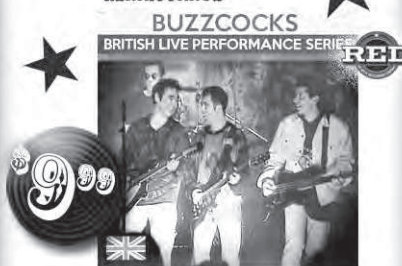
BUZZCOCKS BRITISH LIVE PERFORMANCE SERIES