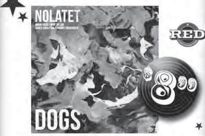
NOLÄTET DOGS Also on vinyl and live at the Cozmic 4/14