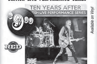
TEN YEARS AFTER BRITISH LIVE PERFORMANCE SERIES