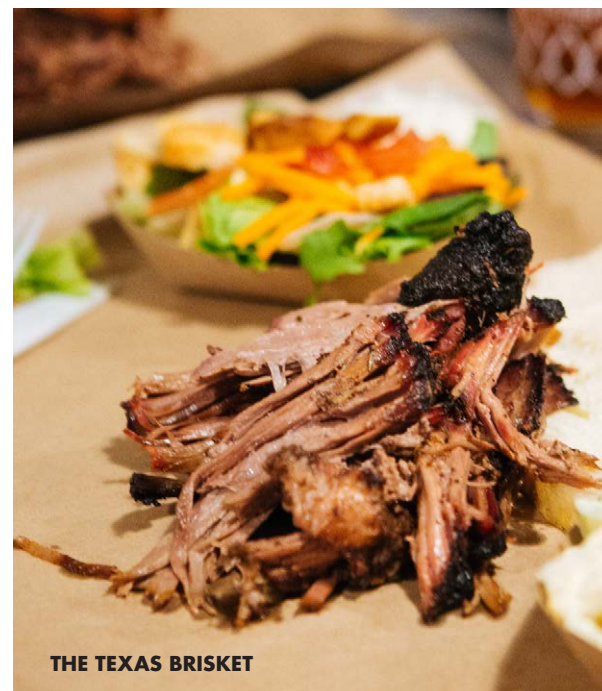
THE TEXAS BRISKET