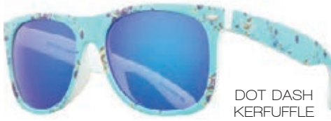
DOT DASH KERFUFFLE

SHOES TO GET YOU TO BREAKFAST, SUNGLASSES TO HIDE THE HANGOVER