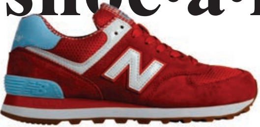
WOMEN'S NEW BALANCE 574 PICNIC