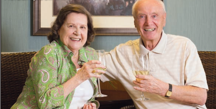
Actual Spectrum Residents

960 Charnelton 541-345-7521 Mon-Sat 9-5:30 | Sun 11:30-5 hutchsbicycles