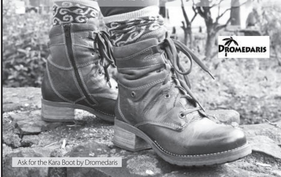
Ask for the Kara Boot by Dromedaris