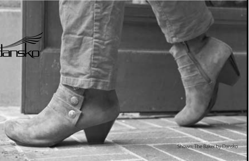
Shown: The Baker by Dansko