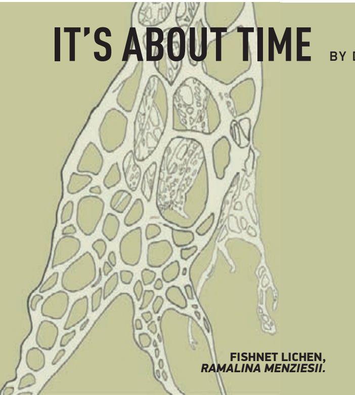
FISHNET LICHEN, RAMALINA MENZIESII.

T he chanterelle season got a bountiful start this year. A dry summer favors high production in this mushroom. Then rains followed by a warm spell made the first flush not only plentiful but with wonderful shape and form.