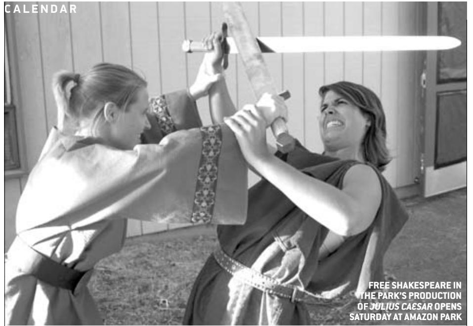
FREE SHAKESPEARE IN THE PARK'S PRODUCTION OF JULIUS CAESAR OPENS SATURDAY AT AMAZON PARK