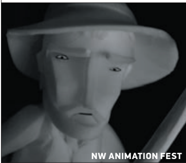
NW ANIMATION FEST