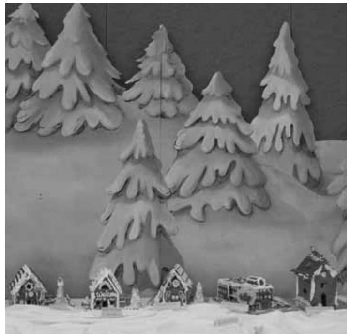
FLORENCE EVENTS CENTER'S "HOME FOR THE HOLIDAYS" FEATURES A GINGERBREAD VILLAGE

Pacific Rim Art Gallery "Holiday in the Gallery," ongoing member show; ornaments, jewelry, pottery, Xmas cards, & smaller size fine art by members, also a Holiday Sale, through Dec. 22. 405 Hwy 99N