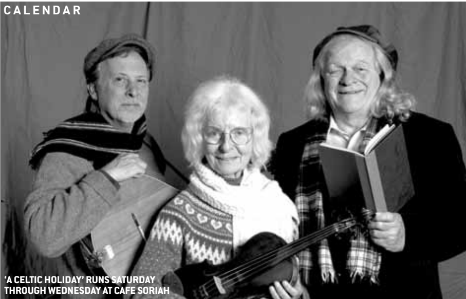
'A CELTIC HOLIDAY' RUNS SATURDAY THROUGH WEDNESDAY AT CAFE SORIAH

A Celtic Holiday, music & song & reading of Dylan Thomas' "A Child's Christmas in Wales," 3pm today & tomorrow, 9:30pm Monday through Thursday, Dec. 20, Cafe Soriah, 382 W. 13th Ave., RSVP at 342-4410. $10.