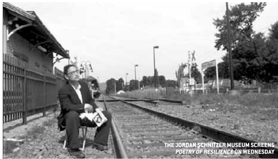
THE JORDAN SCHNITZER MUSEUM SCREENS POETRY OF RESILIENCE ON WEDNESDAY