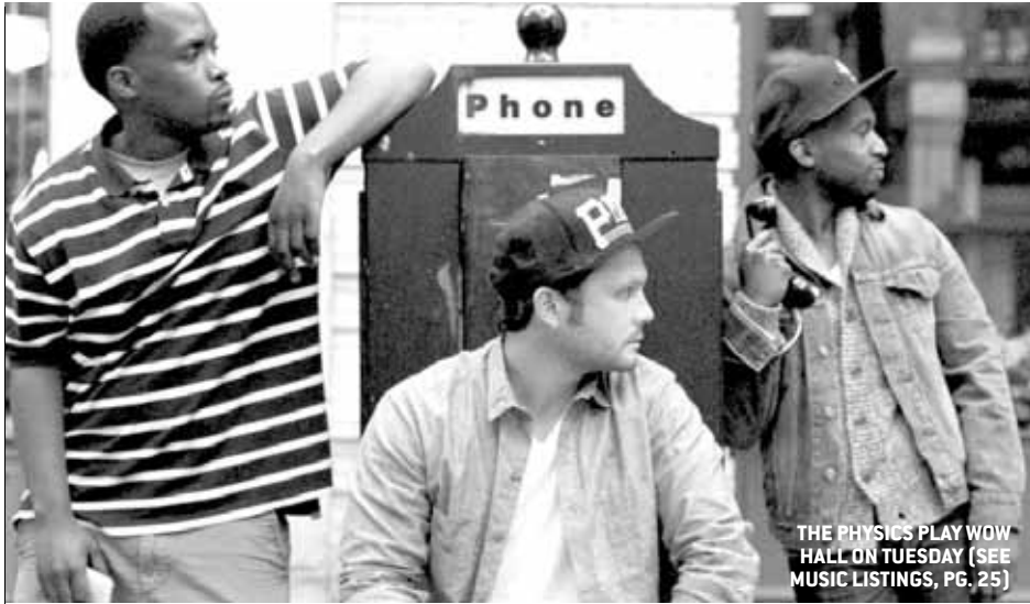
THE PHYSICS PLAY WOW HALL ON TUESDAY (SEE MUSIC LISTINGS, PG. 25)