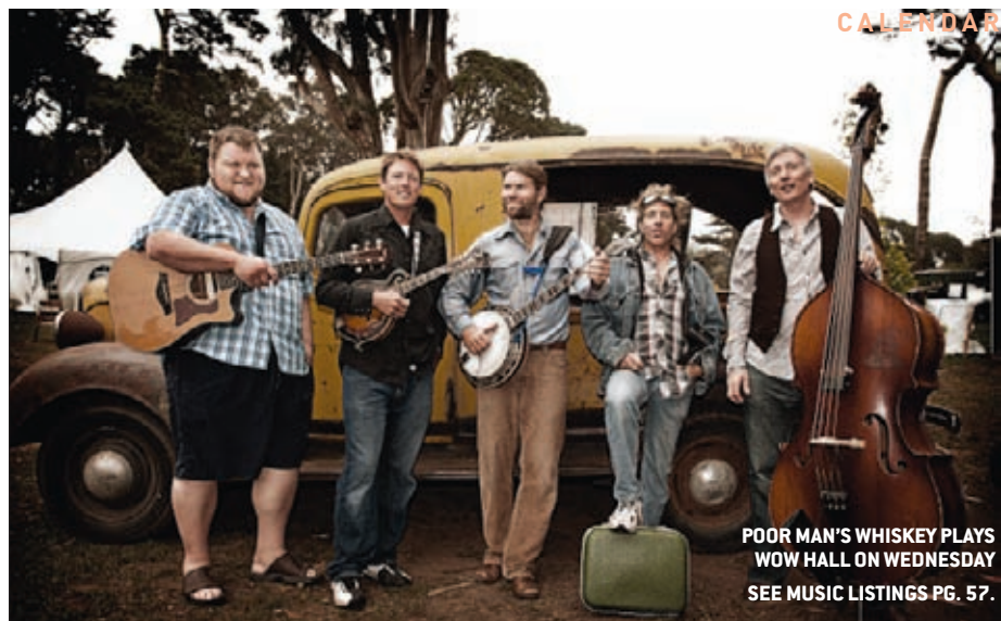
POOR MAN'S WHISKEY PLAYS WOW HALL ON WEDNESDAY SEE MUSIC LISTINGS PG. 57.

EuGenius Winter Market, noon-6pm every Saturday & Sunday through Jan 27, EuNique Indoor Street Faire Marketplace, suite 412, Gateway Mall, Spfd.