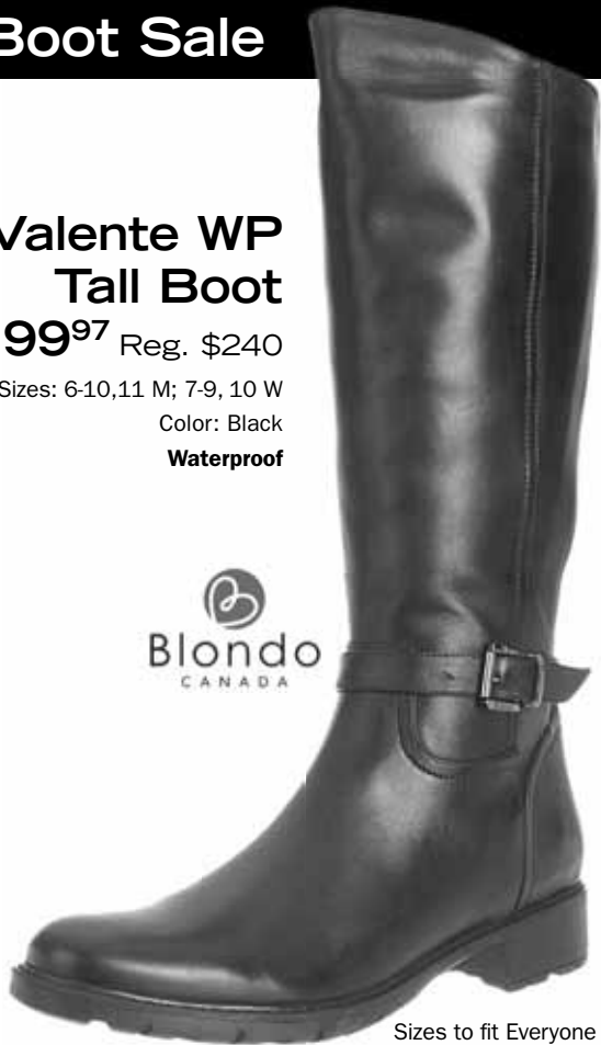
Sizes to fit Everyone

All Women's Boots ON SALE through November 3