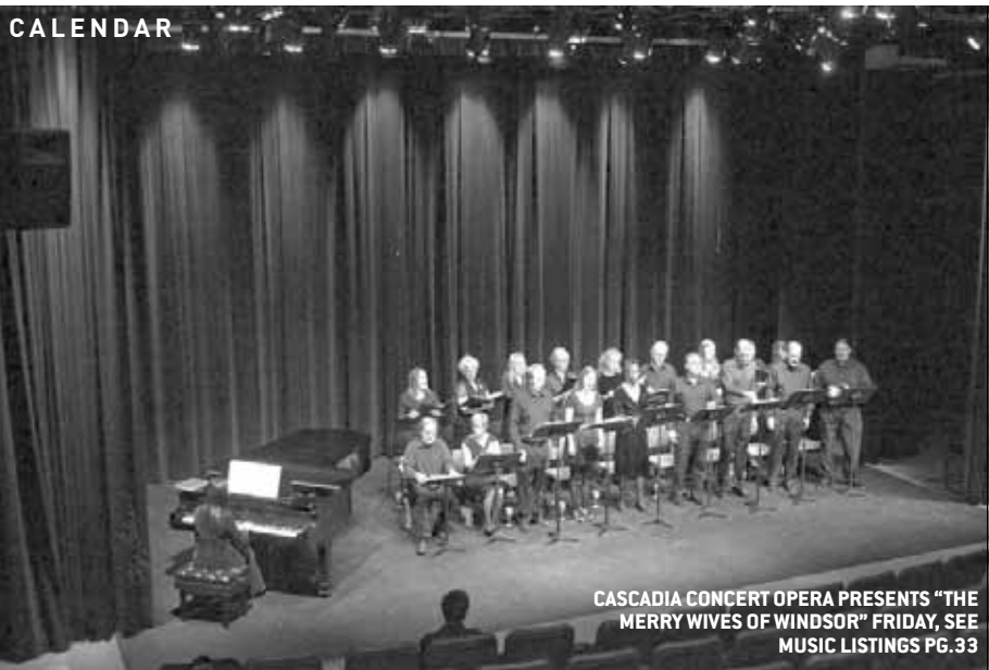
CASCADIA CONCERT OPERA PRESENTS "THE MERRY WIVES OF WINDSOR" FRIDAY, SEE MUSIC LISTINGS PG. 33

Eugene Ski Swap continues. See Thursday, Oct. 25.