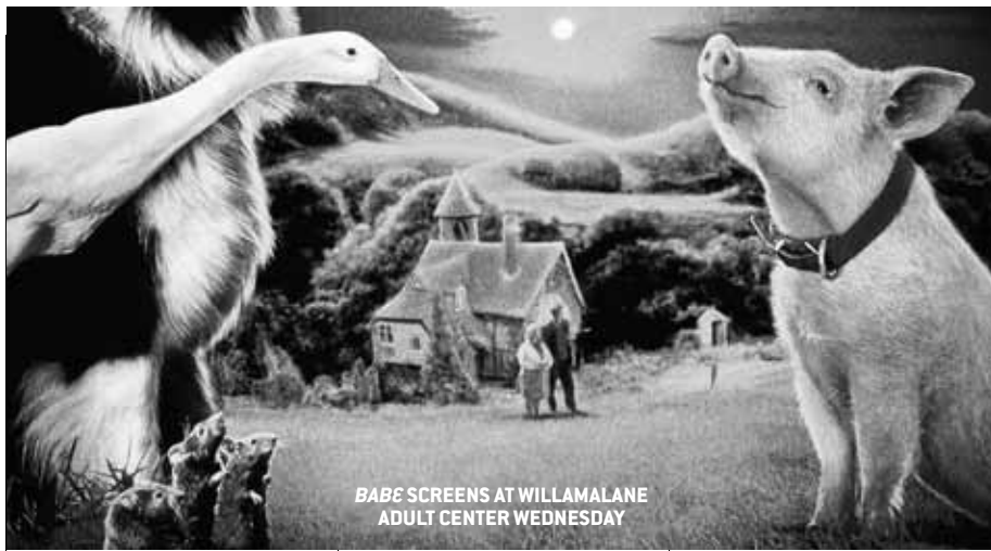
BABE SCREENS AT WILLAMALANE ADULT CENTER WEDNESDAY

Rd.; 11:15am, Sheldon Branch Library, 1566 Coburg Rd., FREE.