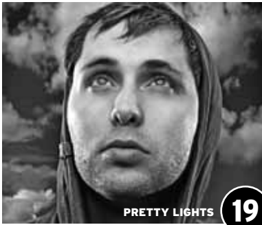
PRETTY LIGHTS 19