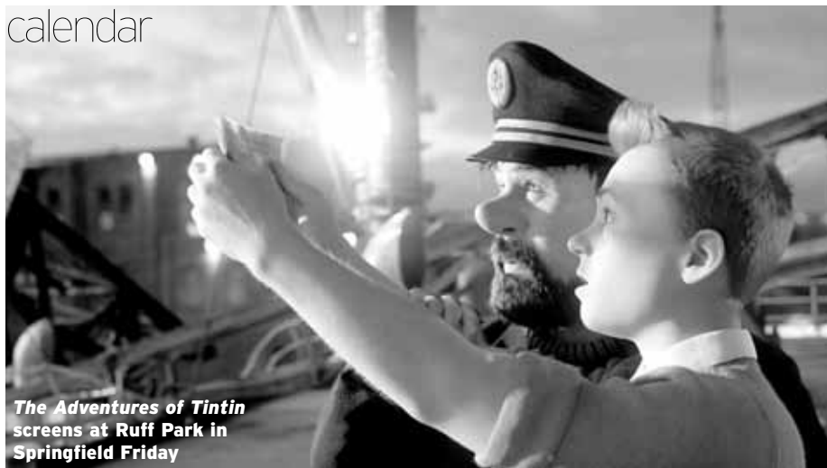
The Adventures of Tintin screens at Ruff Park in Springfield Friday

Ave., Spfd. Irving Garage Community Market, 10am-4pm, 1011 Irvington Dr., Santa Clara.