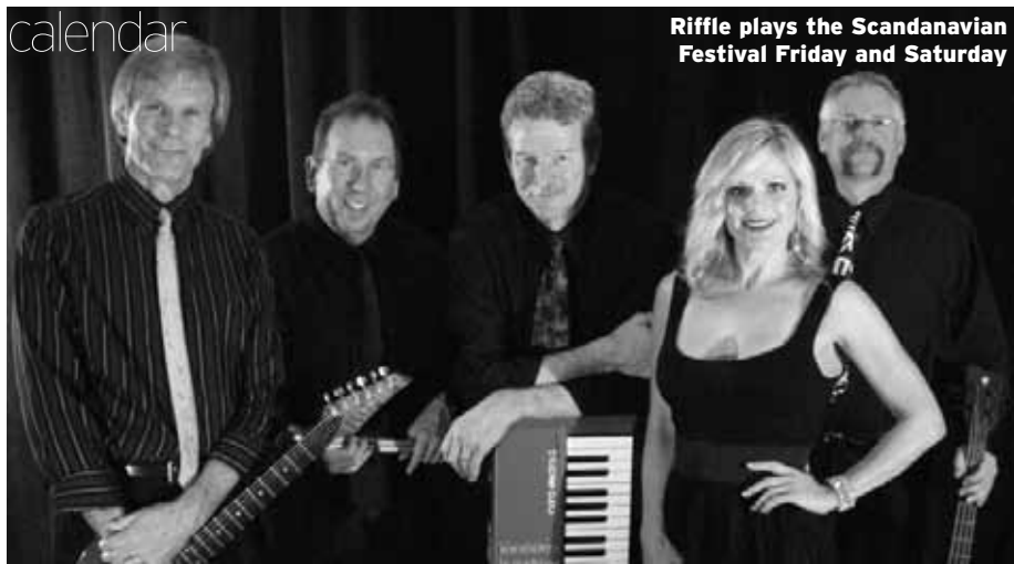
Riffle plays the Scandanavian Festival Friday and Saturday