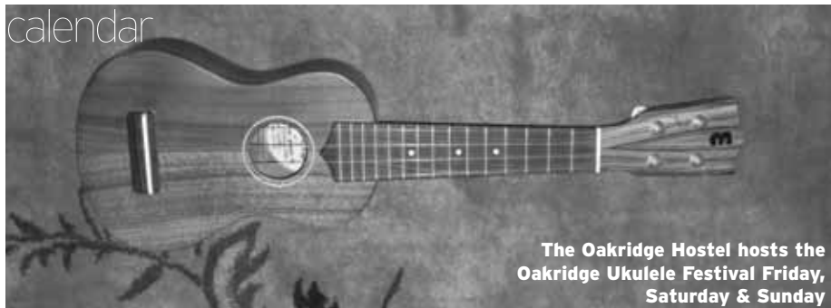
The Oakridge Hostel hosts the Oakridge Ukulele Festival Friday, Saturday & Sunday