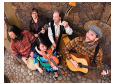
Moon Mountain Ramblers 7:30