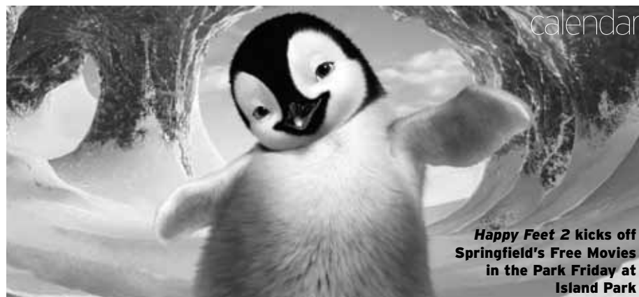
Happy Feet 2 kicks off Springfield's Free Movies in the Park Friday at Island Park

SPIRITUAL Water Blessing Ceremony, 11:40am-12:10pm, EWEB Plaza Fountain. FREE.