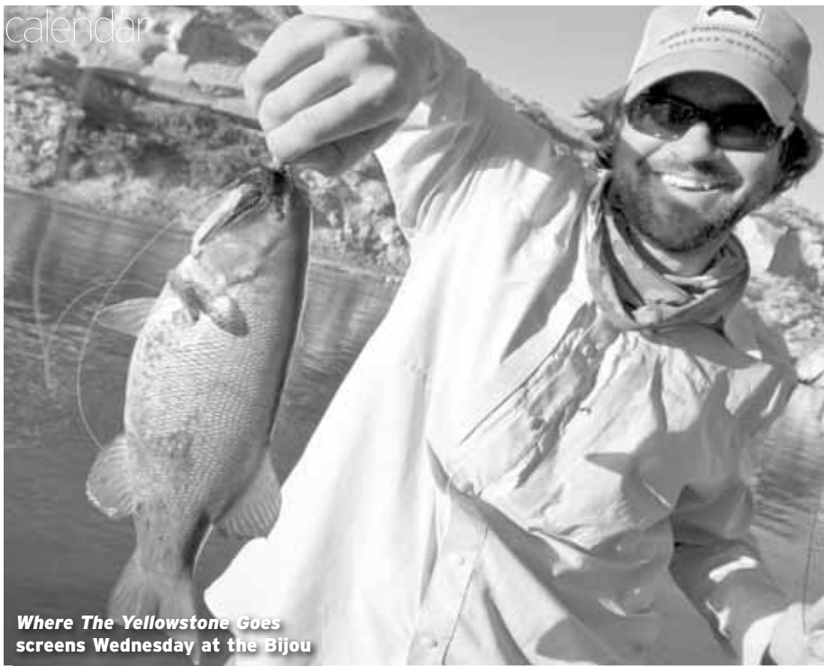
Where The Yellowstone Goes screens Wednesday at the Bijou