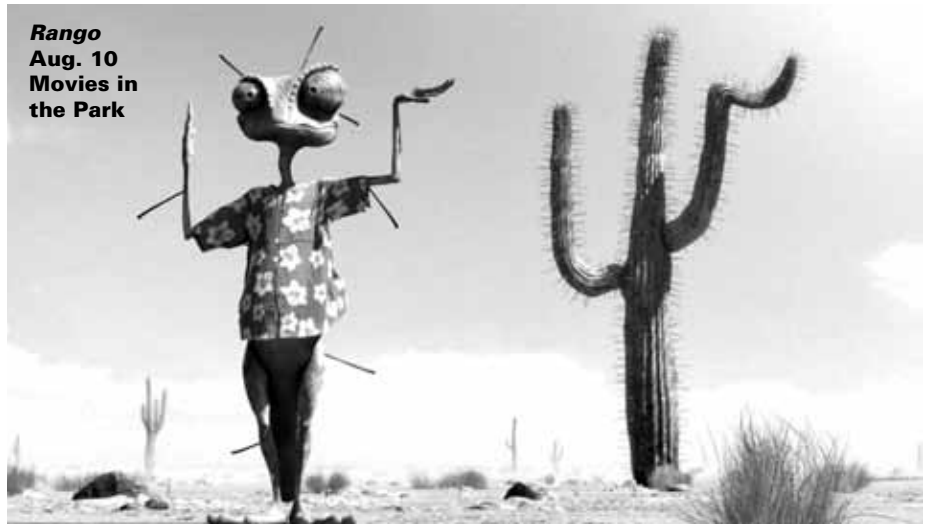
Rango Aug. 10 Movies in the Park

www.atthefair.com $9, $6 under age 12, FREE under age 5.