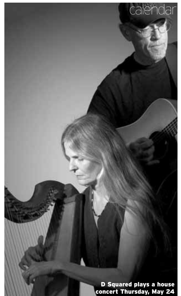
D Squared plays a house concert Thursday, May 24