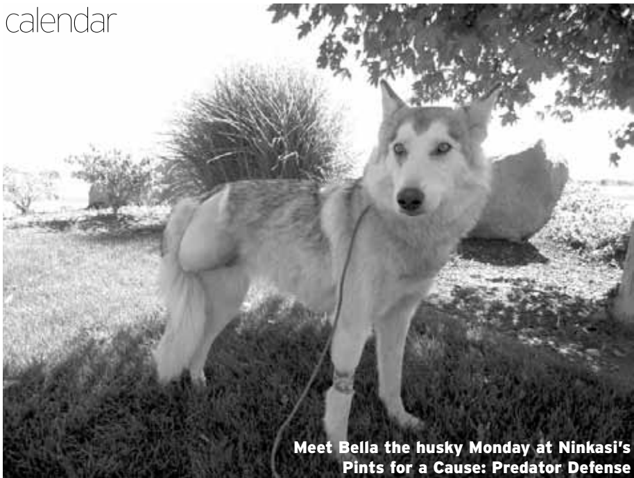
Meet Bella the husky Monday at Ninkasi's Pints for a Cause: Predator Defense