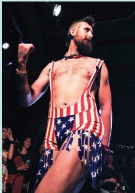
ALLIHALLA BY ALLI DITSON