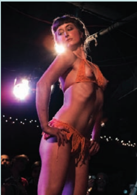
ELEMENTAL ALCHEMY BY STEPHANIE KING