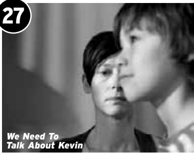
We Need To Talk About Kevin