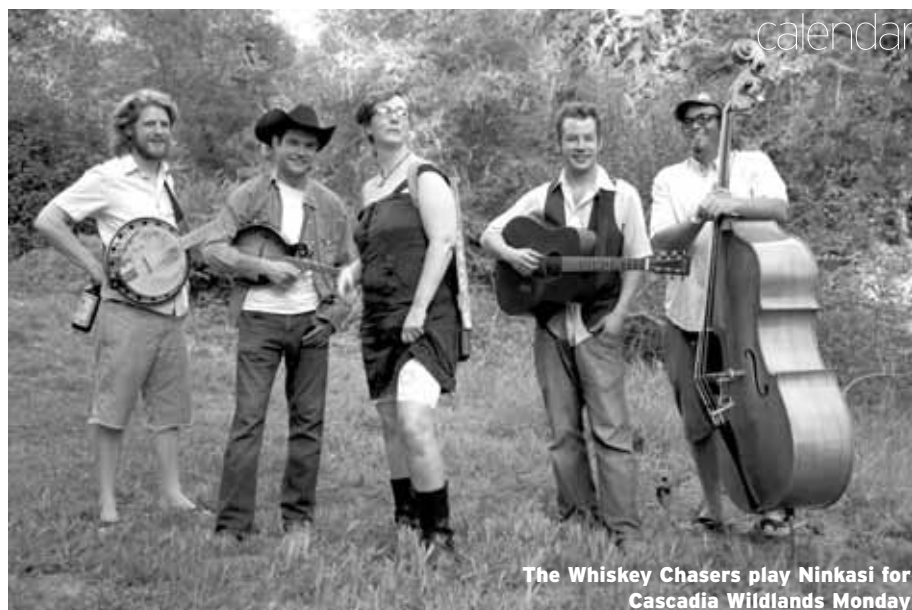
The Whiskey Chasers play Ninkasi for Cascadia Wildlands Monday

Preschool Storytime, ages 3-6, 10am, Springfield Library, 225 5th St., Spfd. FREE.