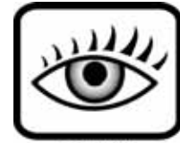
I SAW YOU

FUNNY CRAZY FUNNY Hey, I am a funny guy that likes everyone. Lets have fun. tomy-2tone233, 47, ☐