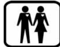
MEN SEEKING WOMEN

FUNNY, OPEN MINDED looking for someone funny that can roll with punches. I like shopping for crazy furniture, paintings, and odd books. I believe your never done learning, I try to learn something every day. mmc008, 23