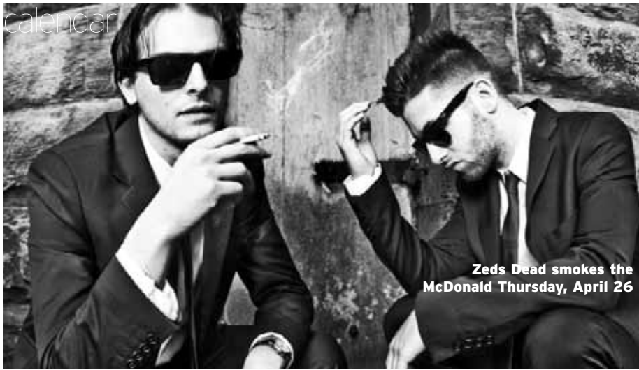
Zeds Dead smokes the McDonald Thursday, April 26