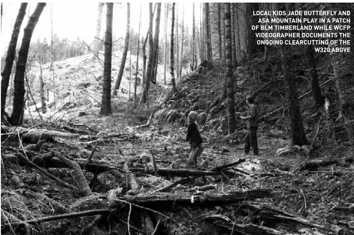
LOCAL KIDS JADE BUTTERFLY AND ASA MOUNTAIN PLAY IN A PATCH OF BLM TIMBERLAND WHILE WCFP VIDEOGRAPHER DOCUMENTS THE ONGOING CLEARCUTTING OF THE W320 ABOVE

WCFP supporters are not anti-logging. Many community forest organizers selectively harvest and mill trees on their own land, producing logs for pole building, dimensional lumber and hardwood products for cabinetry. Local wildcrafters harvest multiple forest products, from matsutake and chan-