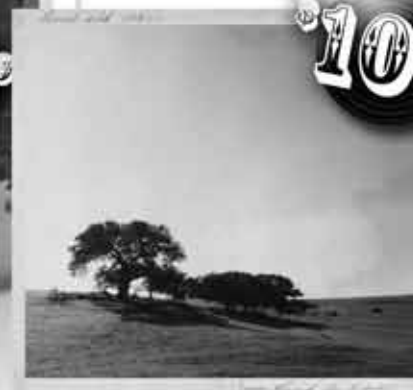
GOOD OLD WAR-COME BACK AS RAIN: Philadelphia-based band harnesses the high-spirited simplicity that makes their shows so unforgettable. Like Only Way To Be Alone and their 2010 self-titled sophomore effort, Come Back as Rain showcases the delicately textured melodies and multipart harmonies that have become the band's signature.