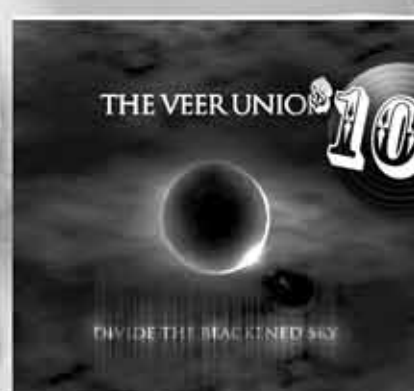
VEER UNION-DIVIDE THE BLACKENED SKY: The Vancouver based band makes its triumphant return with the release of their self-produced sophomore album, Divide the Blackened Sky on 3/27/12. They pick up right where they left off, delivering a rock record that hits you in the face from the first song to the last.