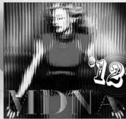
MADONNA-MDNA - PA: MDNA, the long-awaited follow-up to her 2008 album Hard Candy, features production from Benny Benassi, The Demolition Crew, William Orbit, Martin Solveig and others. Includes the first single 'Give Me All Your Luvin' featuring Nicki Minaj and M.I.A. In the 80s Madonna achieved notoriety for her flagrant sexuality, which saw some tag her as a soft-porn star who happened to sing.