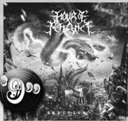
HOUR OF PENANCE-SEDITION: Poised to strike and devastate the ears of the loyal disciples of death metal once more with a merciless master class in brutality entitled Seditio. Unleashing a likely tour de force in maniacal death metal brutality, a celebration of music in its darkest and most inhuman form, Hour of Penance have ascended to an even greater height of precision savagery.