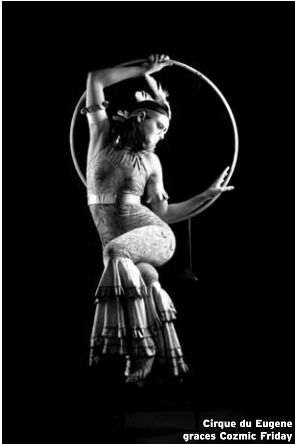
Cirque du Eugene graces Cozmic Friday

Dirty Rotten Scoundrels continues. See Thursday, March 29.