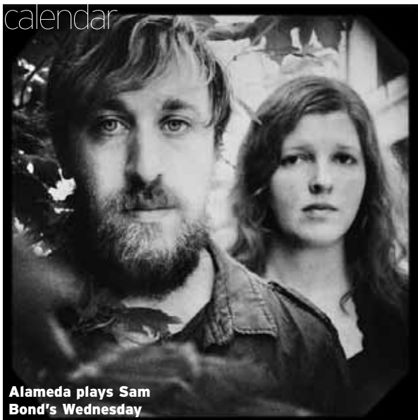
Alameda plays Sam Bond's Wednesday

Prenatal Yoga continues. See Thursday, March 22.