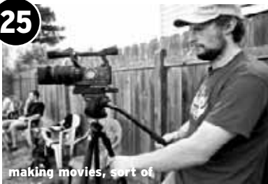
making movies, sort of