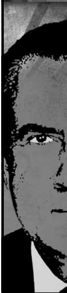
Nixon in China

UO TICKET OUTLET IN THE EMU: Mon-Fri, 9 AM-5 PM