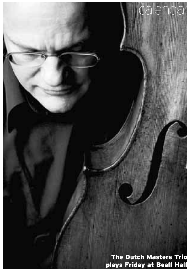
The Dutch Masters Trio plays Friday at Beall Hall

Cuban Salsa, 5pm lesson, 6pm social dance, Courtsports, 2728 Pheasant Blvd., Spfd., see www.eugeneecasinos.com for info. $2 sug. don.