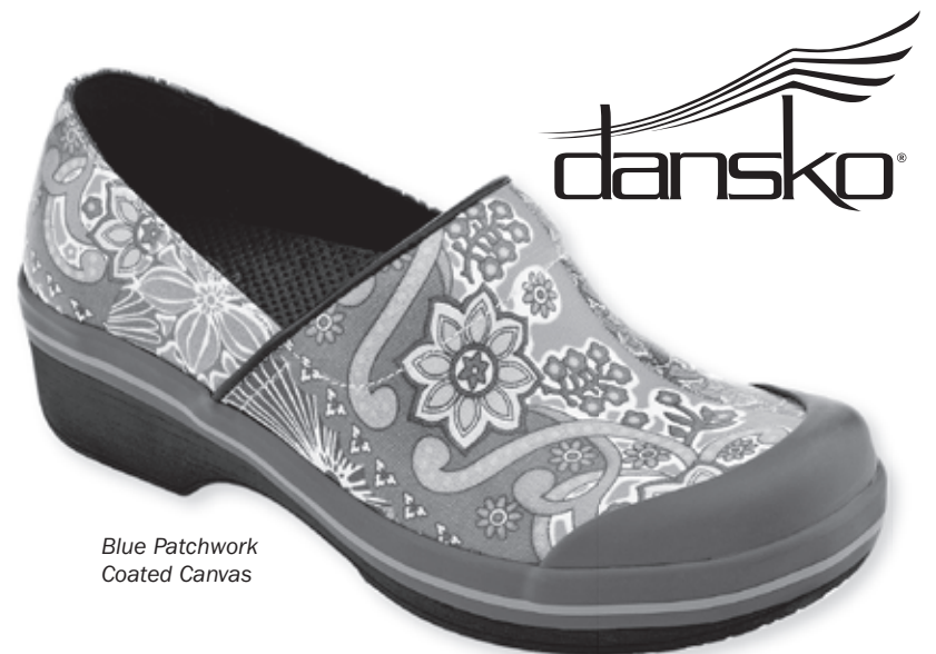
Blue Patchwork Coated Canvas